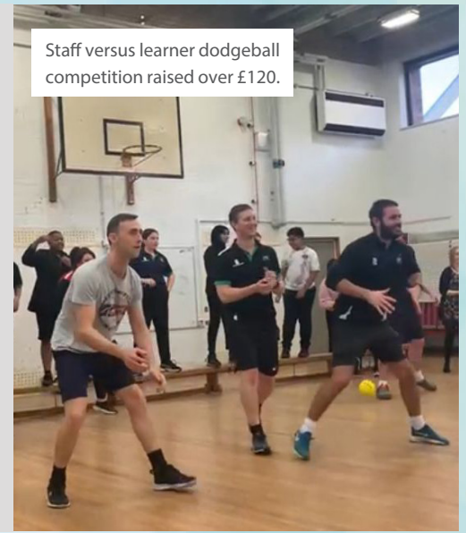
Staff versus learner dodgeball competition raised over £120.

We have continued our efforts to listen to learner voice and their passion for helping others. In doing this, they have raised over £420 by running a staff dodgeball versus learner competition and simply donating money into our donation pot. Thank you to all who have contributed money that will continue to be raised for Palestinian children affected by conflict.