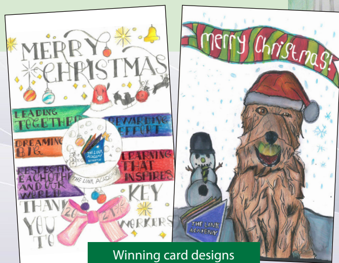
Winning card designs