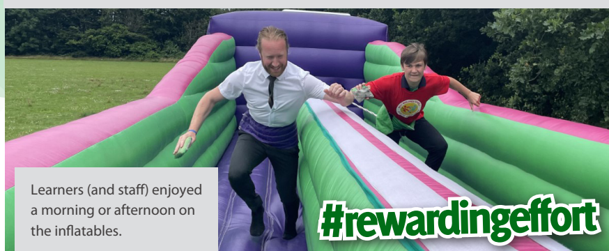
Learners (and staff) enjoyed a morning or afternoon on the inflatables.