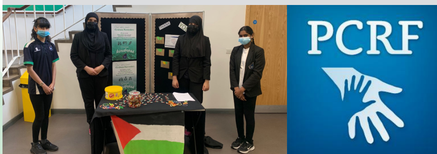
Students have been organising and leading charity activities over breaktime this term to raise money for the Palestine Children's Relief Fund.