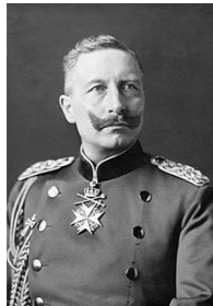
Kaiser Wilhelm II